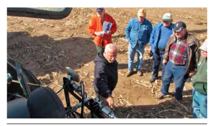
McFarlanes' combined their traditional Tillage Days with a Fendt Field Day to illustrate the features of both.

"While the crowd might have been lower than normal, the people who did show up were definitely interested in the equipment."