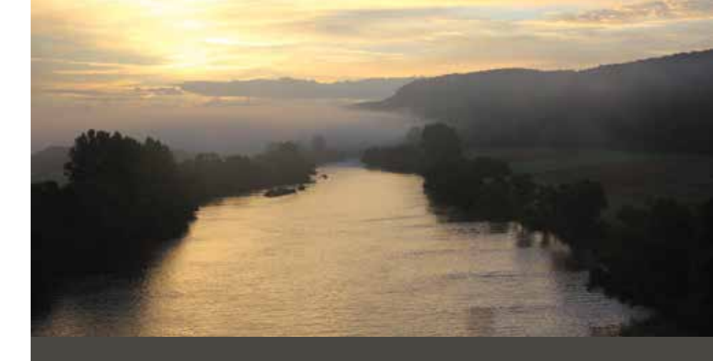
The Fendt Dealer/Customer Trip to Germany included more than the Fendt Field Days and the Fendt factory tour. The itenerary also included time for shopping, sightseeing, farm visits and relaxation, as well as special tours of castles, gardens, and historic landmarks that provided a unique opportunity to experience the county and its culture.