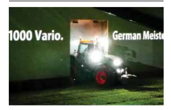
The crowds were gathered all day just to get a first glimpse and take a picture of the new Fendt 1000 Series

The crowd cheered wildly at the dealer preview event for the highly anticipated world premier of the new Fendt 1000 Series.