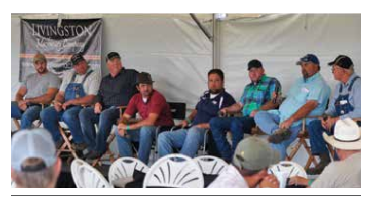
The Fendt owners' panel answers questions from the crowd of interested farmers over the lunch hour.