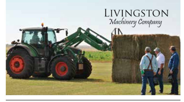
A show attendee moves hay in the loader competition as other customers watch the stopwatch and the smooth, fast operation of the hydraulics.

"The most popular thing, though, was the owners panel that was held over the lunch break," he adds. "We had a group of current Fendt owners talk about their tractors and take questions from the crowd. They weren't trying to sell anything, so their comments really seemed to carry a lot of weight with potential customers. Overall, we couldn't have asked for a better day."