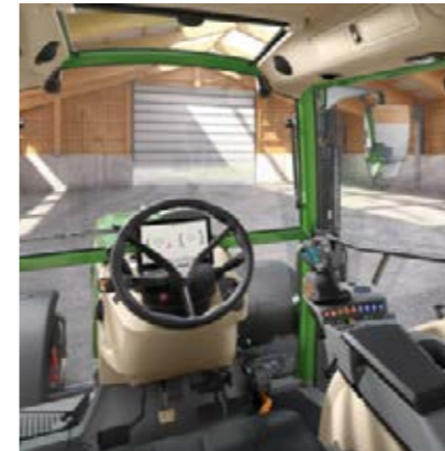
Power Setting 1

You can opt between 2 different settings for each equipment variant. The images show the different lines with optional accessories.