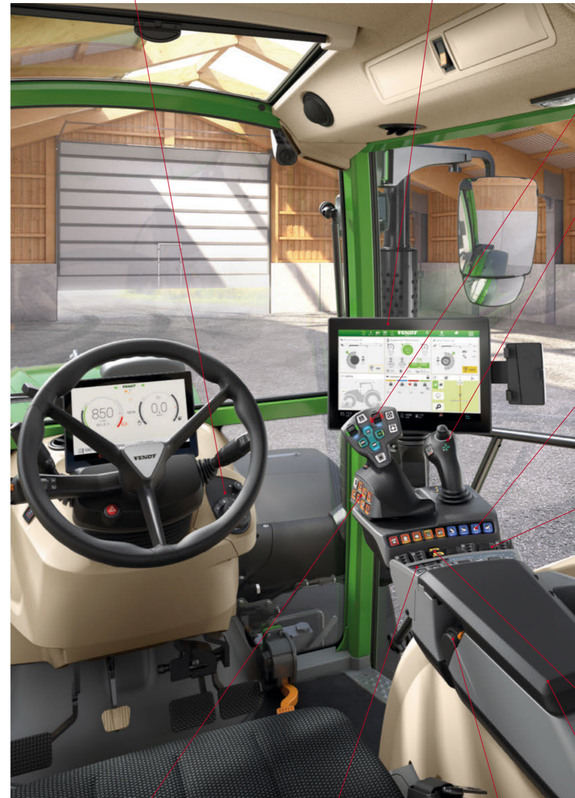
As well as the familiar clover leaf operation, the new multifunction joystick includes two controls for proportional valve control as well as four freely assignable white keypads.