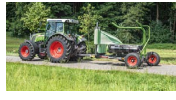
Practical: You can store up to three film rolls on the Rollector 130.