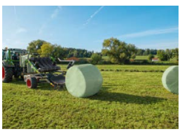
The Rollector 160 is equipped with a bale unloading table with active drop – this effectively avoids damage to the film.