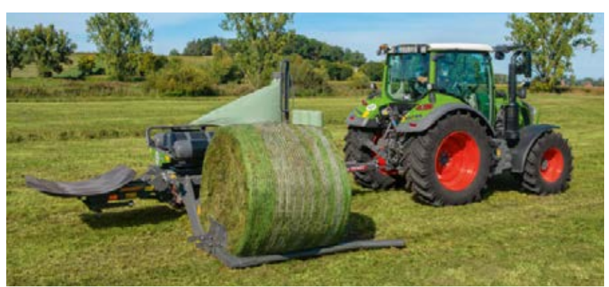
Both the loading arm and the wrapping table can be adapted to different bale sizes. Safely pick up bales with a diameter of 1.25 m to 1.6 m and pack them airtight in film.