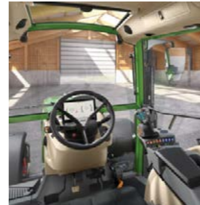
Power Setting 1

You can opt between 2 different settings for each equipment variant. The images show the different lines with optional accessories.