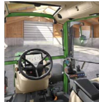
Power Setting 2