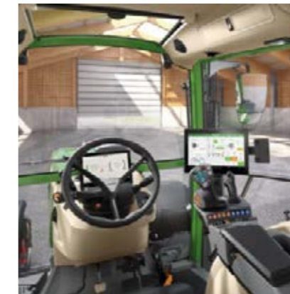
Profi Setting 2