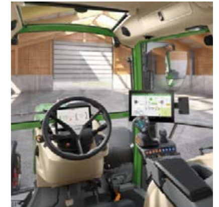
Profi+ Setting 1