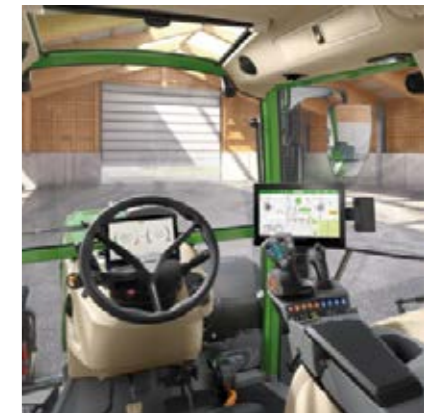
Profi+ Setting 2