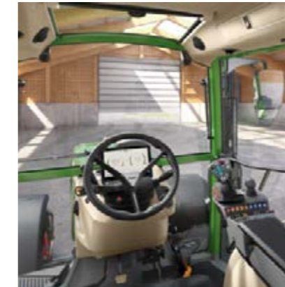
Profi Setting 1