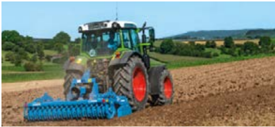
You can work with the correct PTO rpm at any speed thanks to independent control of road speed and engine speed.