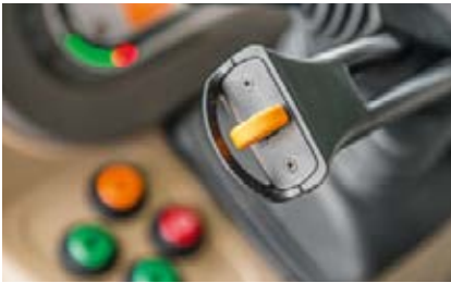
The button located at the end of the steering wheel stalk, can be used to control reverse gear and the Stop & Go function.