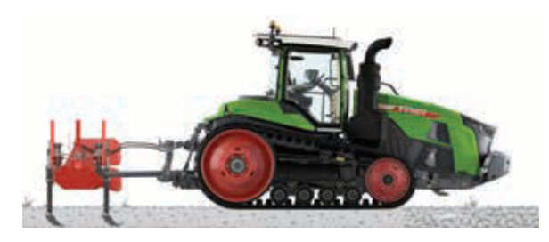
Figure 2: The 1100 Vario MT with Smart Ride Plus allows for easy adjustment of the weight distribution. This results in reduced slip, improved ride comfort, and improved overall performance.