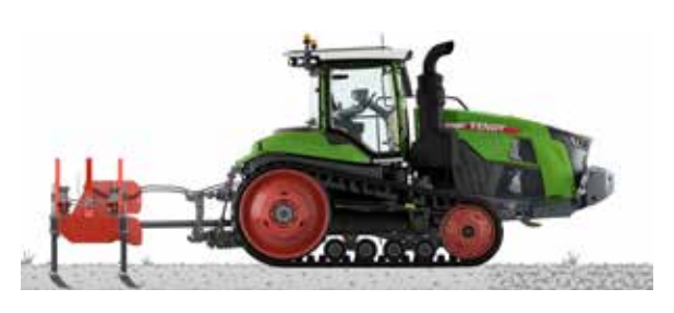
Figure 1: A tractor goes to work without proper tractor and implement weight distribution. This results in insufficient front weight on the tractor, and as a result increases slip.

When equipped with Smart Ride Plus suspension, the 1100 Vario MT features a load-leveling suspension system. With the push of a button in the cab, Smart Ride Plus uses hydraulic pressure in the track suspension elements to raise or lower the front of the machine. This results in better weight distribution for better traction, ride, and overall performance.