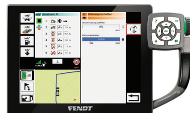
Coolant level and air filter contamination are monitored and can be viewed right on the Varioterminal™

"THE ENTIRE SYSTEM WAS DESIGNED TO HANDLE OUTSIDE TEMPERATURES AS HIGH AS 113 DEGREES FAHRENHEIT (45° C). AT THE SAME TIME, THE FAN EFFICIENCY WAS INCREASED BY UP TO 50 PERCENT THROUGH NEW ARCHITECTURE."